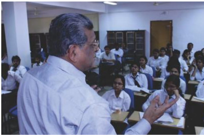
Hon'ble Justice S Rajendra Babu, Former Chief Justice of India, conducting Constitutional Law Class

SCHOOL OF PRIVATE LAW: The School of Private Law offers a wide spectrum of courses pertaining to private law. The objective of the School is to produce outstanding scientific research and to offer high-quality instruction based on this research. The school stresses the practical and academic importance of national private laws in integration with private laws of other countries. Cross-border research will become