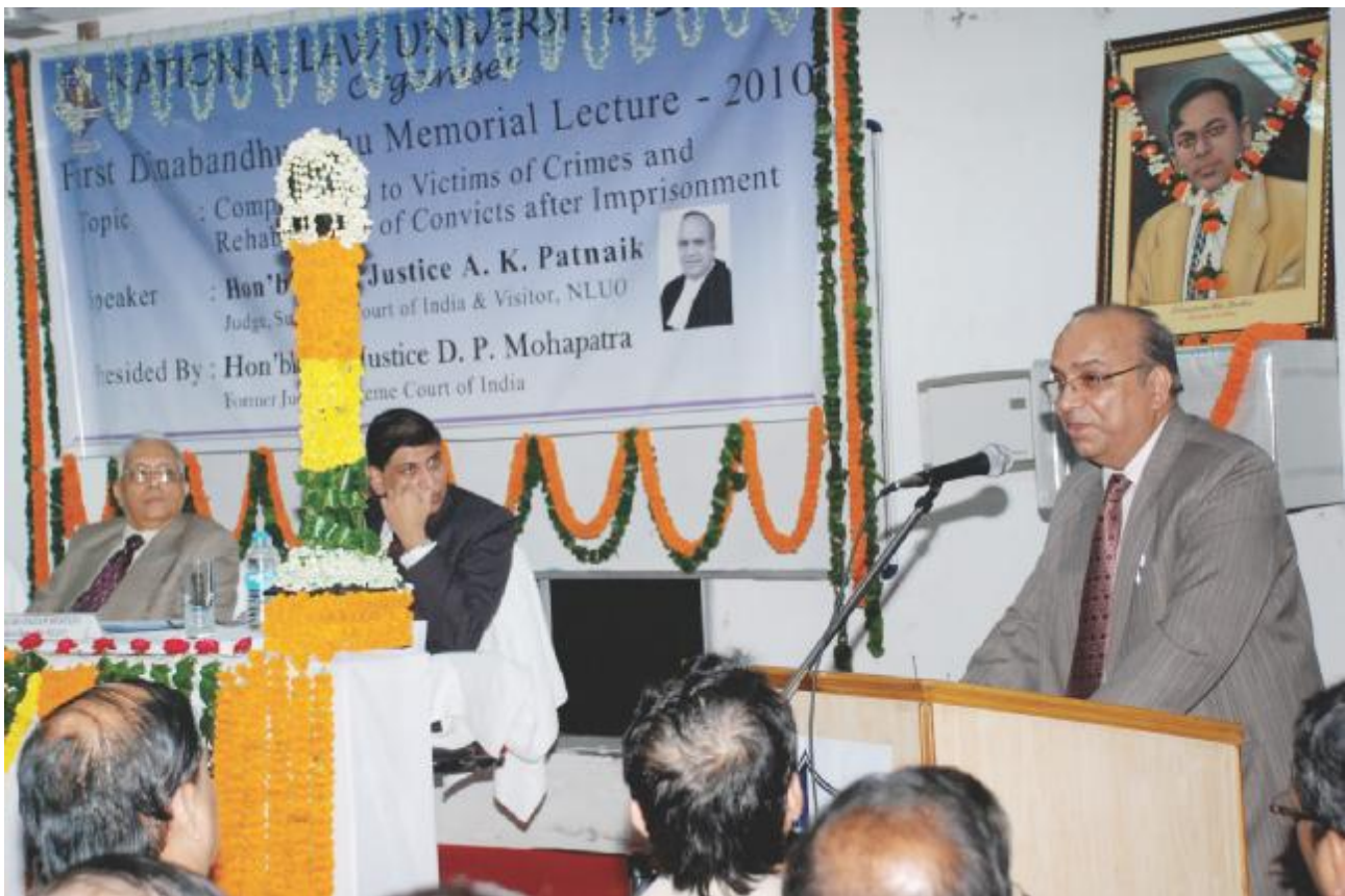
Hon'ble Justice A.K.Patnaik delivering the First Dina Bandhu Sahu Memorial Lecture