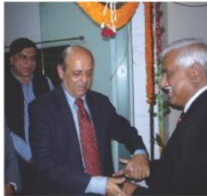
Mr. Naveen B Chawla, Former Chief Election Commissioner of India with the Chief Justice of Orissa at NLUO