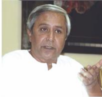
Hon'ble Sri Naveen Patnaik Chief Minister of Orissa