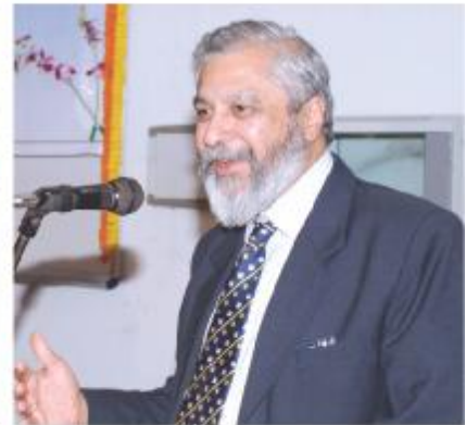
Hon'ble Justice Madan B Lokur, Chief Justice of Guwahati High Court, speaking at NLUO Foundation Day Lecture