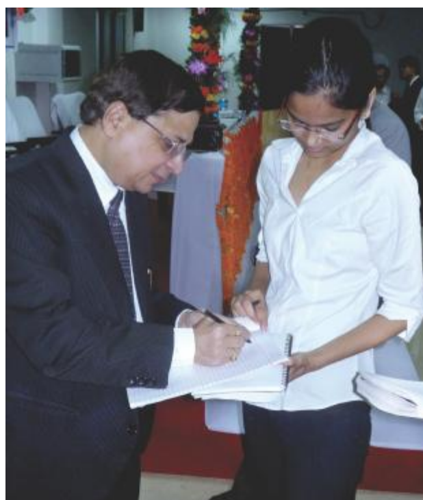
Hon'ble Justice Deepak Mishra, Chief Justice, Delhi High Court explaining a legal issue to a student