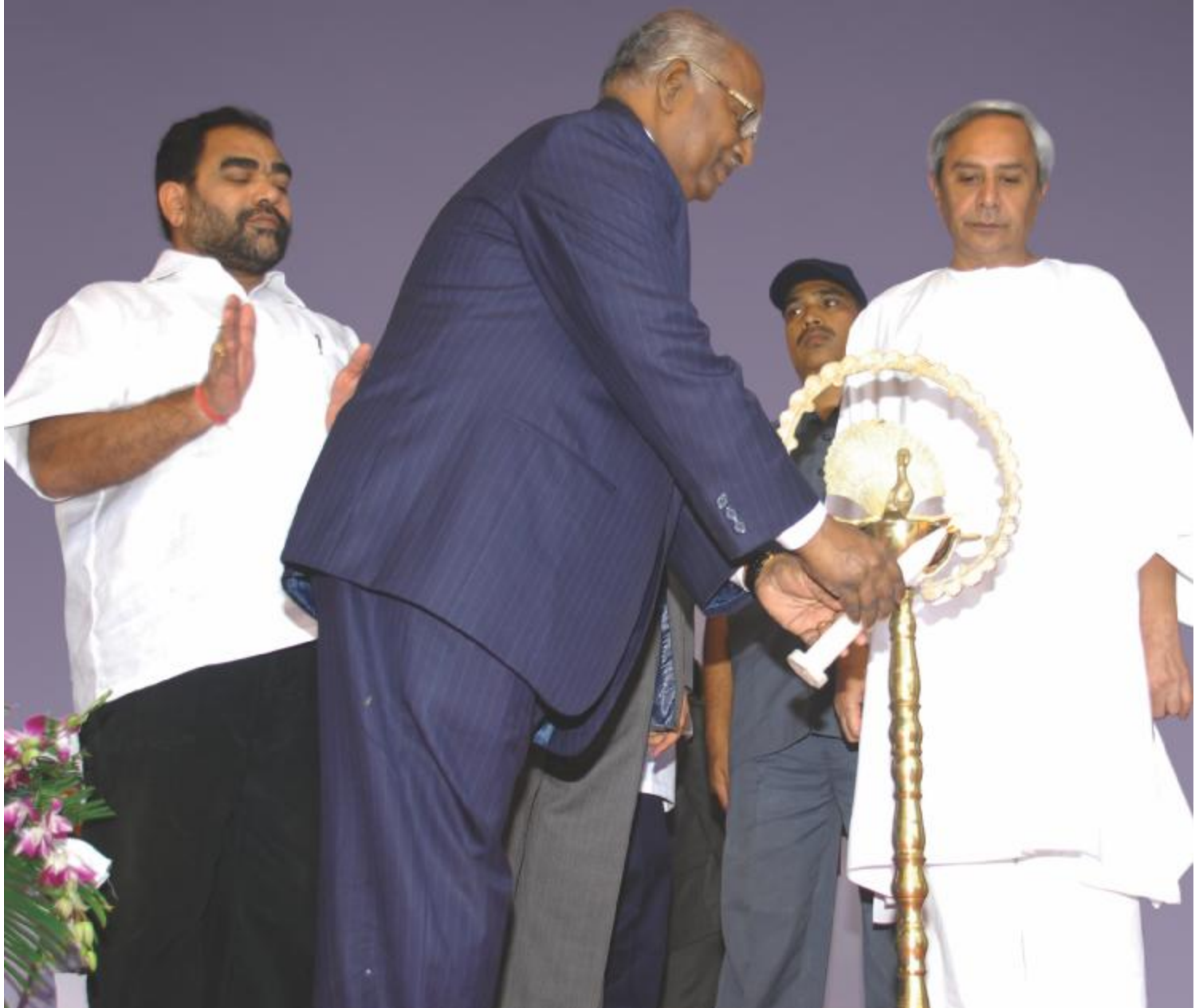
Hon'ble Justice K G Balakrishnan, the then Chief Justice of India and Visitor of NLUO along with Chief Minister and Law Minister of Orissa