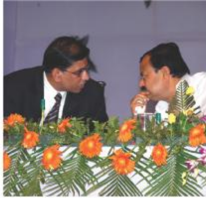
Vice-Chancellor explaining the NLUO Vision to the Higher Education Minister of Orissa