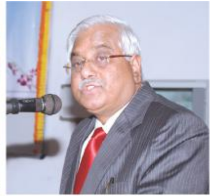
Hon'ble Justice V. Gopala Gowda Chancellor and Chief Justice of Orissa addressing the students