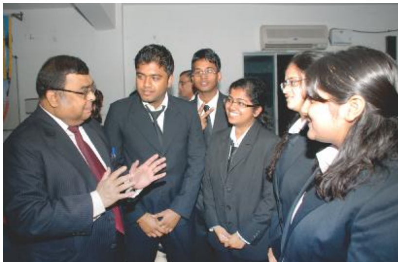
Hon'ble Justice Altamas Kabir, Senior most Judge of Supreme Court explaining an intricate legal issue to the students

leading National Law Schools, thereby giving them the advantage of being accustomed to the rigours of the National Law School model.