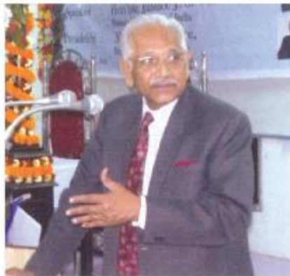
Hon'ble Justice J.S. Verma Former Chief Justice of India & Former Chairman, National Human Rights Commission of India