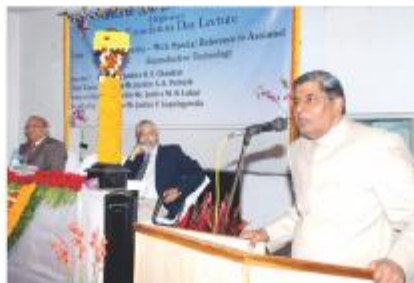
Hon'ble Justice Dr. B.S Chauhan, Judge, Supreme Court of India delivering the First Foundation Day Lecture