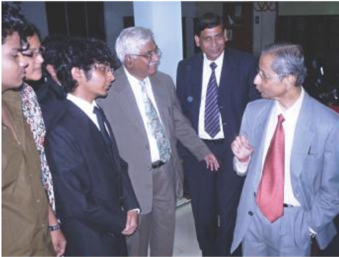
Hon'ble Justice S.B. Sinha, Chairman, TRAI Appellate Tribunal clarifying a doubt of students in a personalised interaction