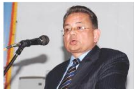
Hon'ble Justice Dalveer Bhandari, Judge, Supreme Court of India speaking at the inaugural function of the Legal Services Clinic