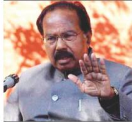
Dr. M. Veerappa Moily Hon'ble Minister for Law and Justice Government of India