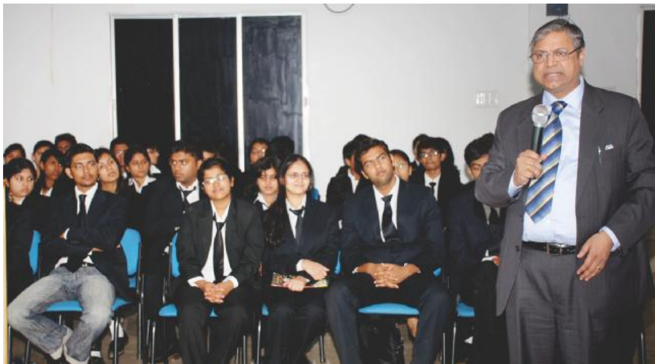
Mr. Gopal Subramaniam, Solicitor General of India teaching Art of Advocacy to NLUO students

The Moot Society is arguably the most important society at NLUO. A moot is a simulated court exercise where students get to hone their litigation skills. Real time skills cannot be taught in the classroom, and court internship aside, mooting is the one way for students to imbibe the skills of their chosen profession. In a short span of two years mooting has taken off in a big way at NLUO. Under the tutelage of committed faculty members we now have a fairly active moot society which, aside from regularly conducting competitive internal moots, prepares teams for representation at moot competitions across the country.