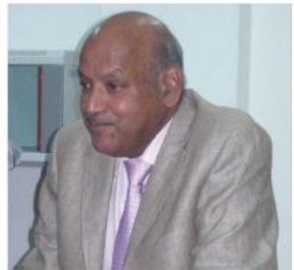
Hon'ble Justice G B Patnaik Former Chief Justice of India interacting with students