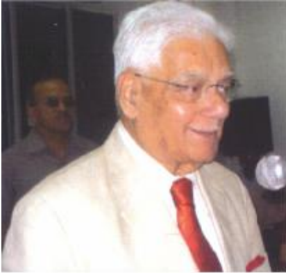
Hon'ble His Excellency Sri Murlidhar Chandrakant Bhandare The Governor of Orissa